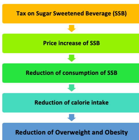
Fig 4: SSB taxation pathway.

We can have a look at this logical pathway of SSB taxation(9). The logic of this tax is a simple supply-demand theory of economics. Higher the price, lower the demand. Taxation on SSB will increase the beverage price. That results in reduced purchase and consumption of SSBs. Reduction in consumption means decreased calorie intake, which will lower the burden of overweight and obesity(Fig:4). That will reduce the risk of cardiovascular diseases, diabetes, stroke, or hypertension eventually.